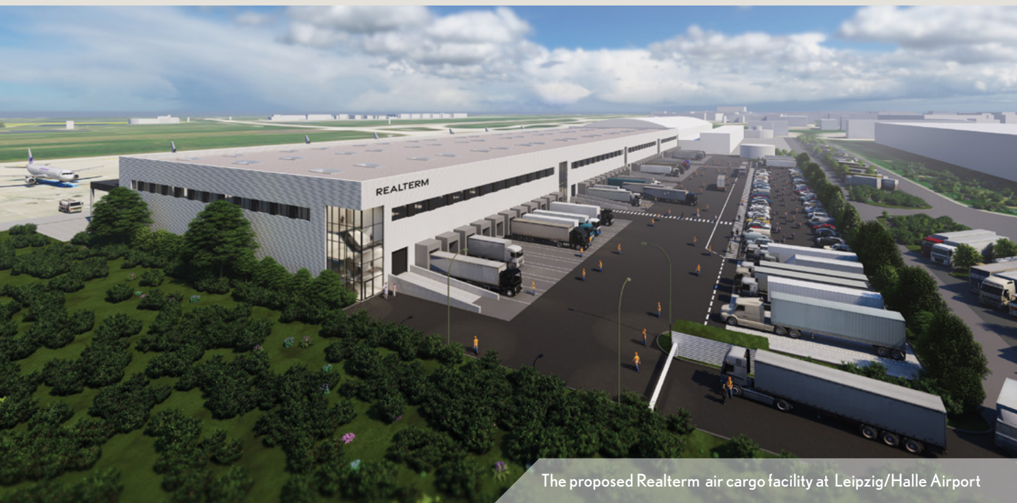
The proposed Realterm air cargo facility at Leipzig/Halle Airport